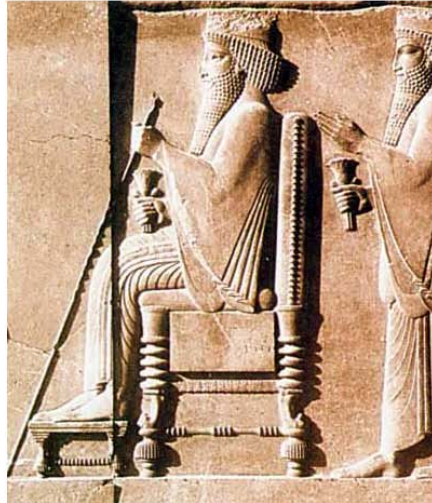
King Darius Seated on his Throne